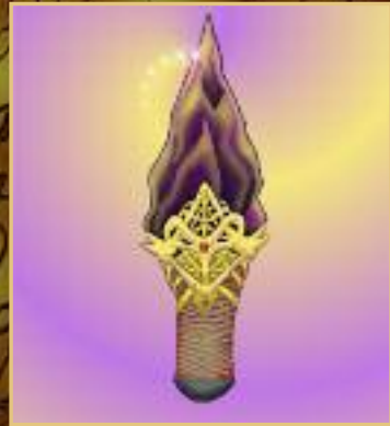
ITEM Magic 1/*

1900 gp STR +1 COR 0 DEF 0 SPD 0 WIS 0 HP 0 CAP -1/2